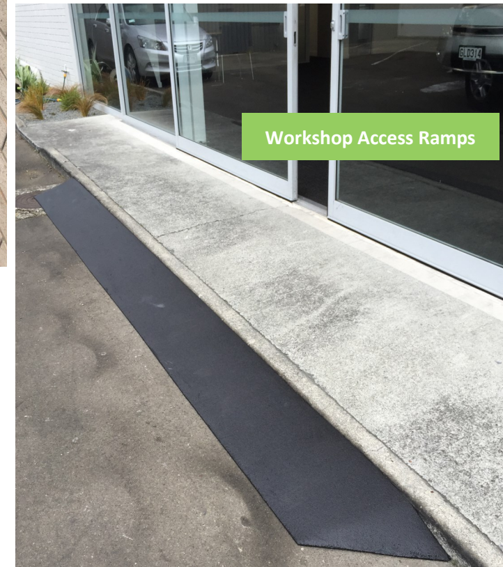
Workshop Access Ramps

Installation onto wooden or concrete surfaces. Bevelled edges to minimise trip hazards. Burgess ramps provide proven durability. Ideal for workshops and suitable for forklifts. Can be custom made to suit most environments. Ensure health and safety requirements are met. Call Burgess Matting today to discuss your requirements.